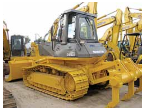
2001 Komatsu D61EX-12, 6,600 smr., #C003919 ..... $68,000