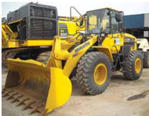
2007 Komatsu WA250-5L, 210 smr., #C003821. ..... $98,000