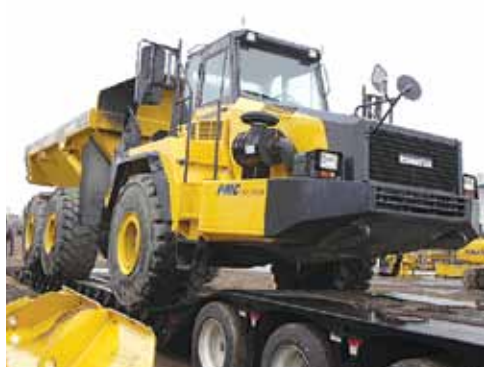
2007 Komatsu HM400-2, 9,500 smr., #C000399 ..... $145,000