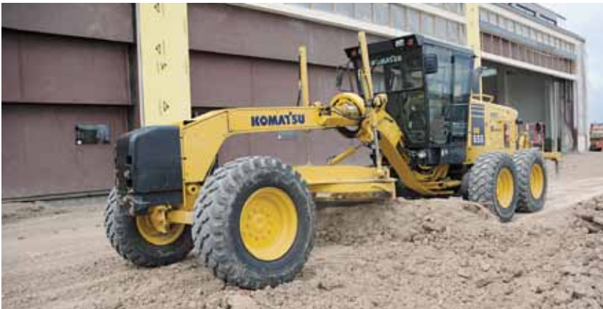
4 Quarters has done a lot of work at the Wyoming Army National Guard facility in Cheyenne recently. Here, an operator uses a Komatsu GD655 to grade for a parking lot.

Komatsu machines dominate 4 Quarters' equipment fleet, which includes six hydraulic excavators, ranging from a compact PC50 up to a PC300; three wheel loaders (WA320 to WA430); four skid steer loaders; and a GD655 motor grader.