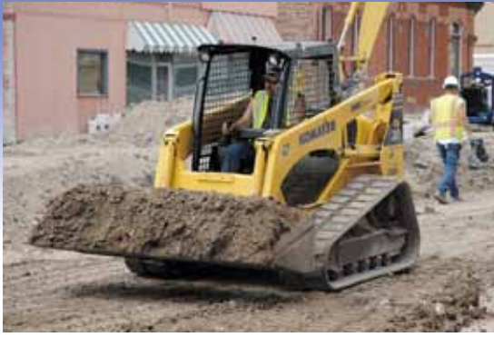
The 4 Quarters fleet of Komatsu equipment includes this CK30 compact track loader.

company's been able to form with larger general contractors, such as Sampson Construction, S&S Builders and Miller Architects & Builders.